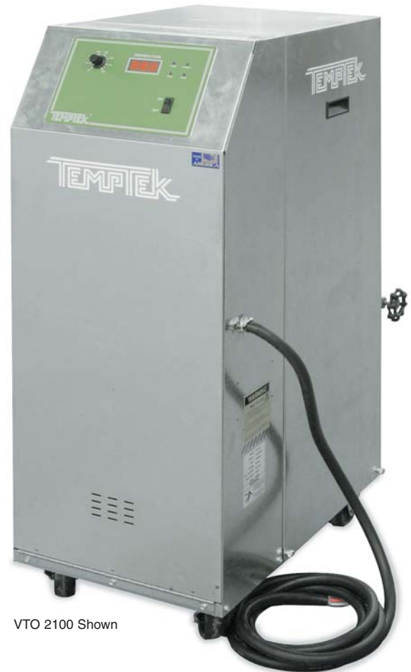
VTO 2100 Shown