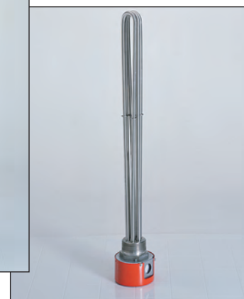
Screw Plug Heater